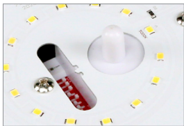
AVAILABLE WITH MICROWAVE SENSOR FITTED