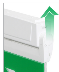
HEAD POSITIONED FOR CEILING MOUNTING