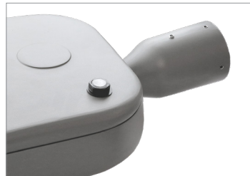
BELFRY PRO WITH PHOTO-CELL FITTED