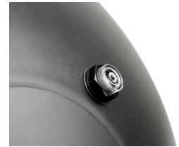
AVAILABLE WITH PE CELL FITTED