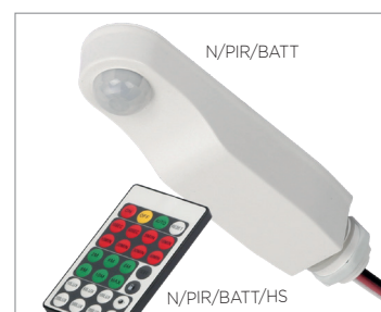
BATTEN MOUNT PIR SENSOR AND REMOTE HANDSET AVAILABLE SEPARATELY - SEE PAGE 98