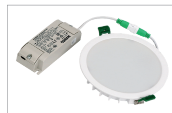
REMOTE MOUNTED OSRAM OR TRIDONIC DRIVER