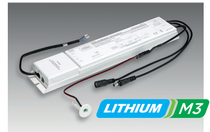
STANDARD OR SELF-TEST EMERGENCY CONVERSION PACK WITH LITHIUM (LiFePO 4 ) BATTERY - SEE PAGE 69