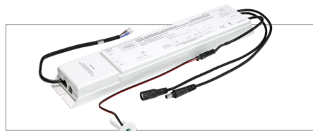
EMERGENCY CONVERSION PACKS AVAILABLE SEPARATELY SEE BELOW