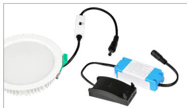
REMOTE MOUNTED OSRAM OR TRIDONIC DRIVER