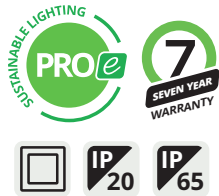
MIAMI GU10 IP65