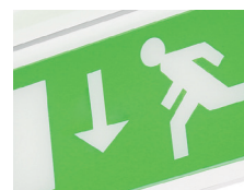
AVAILABLE WITH EITHER "MAN RUNNING THROUGH A DOOR" (ISO7010/BS5266) OR WITH "MAN RUNNING TOWARDS A DOOR" (EURO) LEGENDS