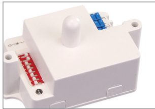
AVAILABLE WITH MICROWAVE SENSOR FITTED