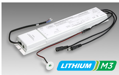
STANDARD OR SELF-TEST EMERGENCY CONVERSION PACK WITH LITHIUM (LiFePO4) BATTERY - SEE PAGE 29